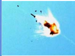
Here's what happened to that rocket target in an April 2013 demo of the Lockheed Martin ADAM laser system.