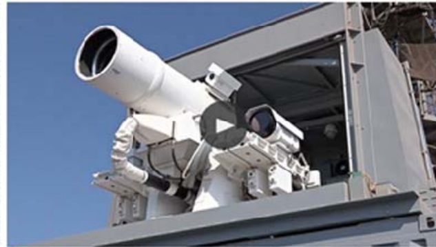
The Afloat Forward Staging Base (Interim) USS Ponce (ASB-15) conducts an operational demonstration in the Persian Gulf.